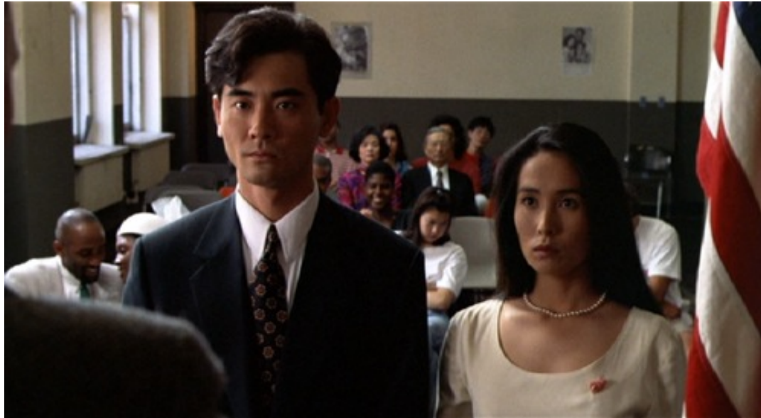
The Wedding Banquet (Ang Lee)

A gay New Yorker stages a marriage of convenience with a young woman to satisfy his traditional Taiwanese family, but the wedding becomes a major inconvenience when his parents fly in for the ceremony. Director Ang Lee came to international prominence with this warm-hearted comedy, which centers on the farcical confusion that emerges from this deception. Gao Wai Tung (Winston Chao) has never shared the truth about his sexuality with his family, and hopes to disguise his long-term relationship with his lover Simon by marrying Wei-Wei, a young artist who's only it for the green card. Never patronizing his characters, Ang Lee combines comedy, both subtle and raucous, with acute social asides. In Mandarin, subtitled.