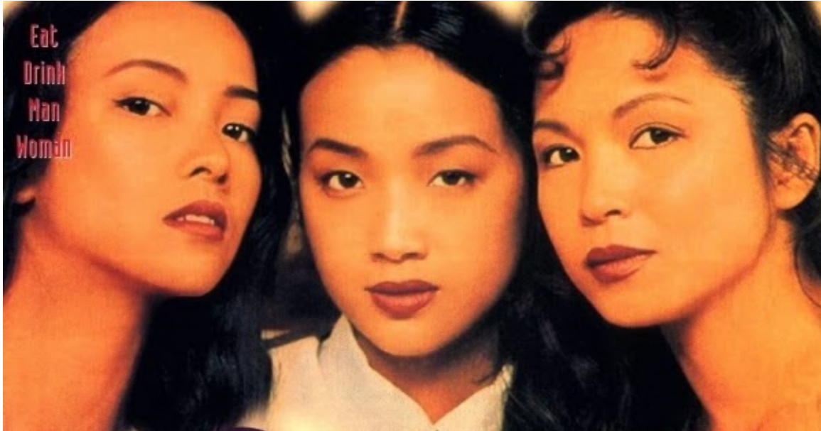
Eat Drink Man Woman (Ang Lee)

This Taiwanese drama centers upon the relationships within a Taipei family. The father is a master chef who's lost his sense of taste. His wife died so now he lives amongst his three grown daughters. All three really want to get on with their own lives. The oldest daughter Jen, is a school teacher adept at hiding her feelings after she suffered a bad love affair in college. Kien who works for the national airline as a senior executive has just put all her savings into a new apartment. Young Ning is in school and works at a fast-food joint. She is getting involved with her best friend's boyfriend. Life within the family gets more tangled when Chu marries Madame Liang, the single mother next door. Ang Lee's generational comedy offers filmgoers a tasty cinematic treat. In Mandarin, subtitled. 1994; 123 min. In Mandarin, subtitled. 1994; 123 min.